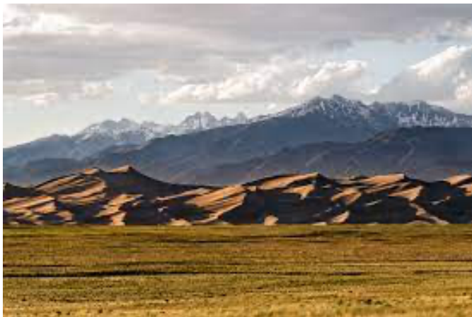
The Great Sand Dunes in the San Luis Valley

The teacher shortage is a big concern and has only grown bigger as a result of the COVID-19 pandemic. It comes up in every (and I mean every) conversation I have with school leaders who continue to struggle to fill open positions in their buildings. We simply