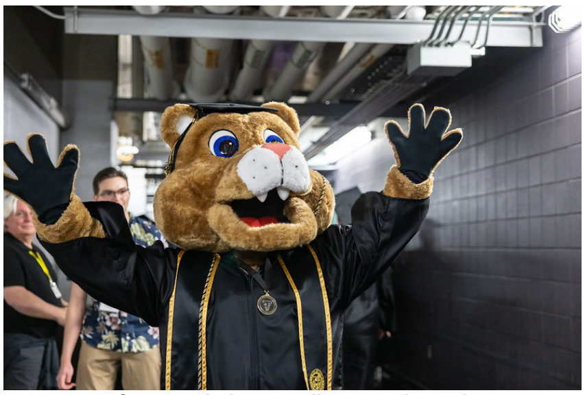
Congratulations to all our graduates!