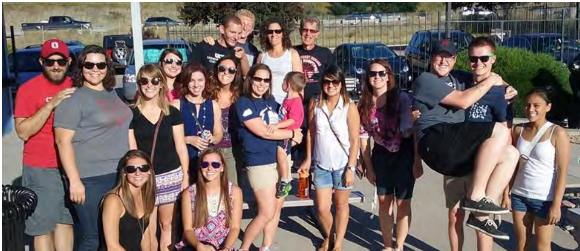
SAHE Students, Family and Friends enjoyed a Mini-Golf Outing on 9/12!