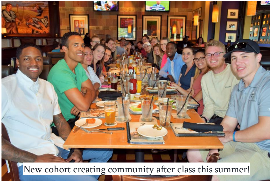
New cohort creating community after class this summer!